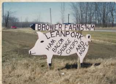
OUR ORIGINAL LOGO FEATURED A PINK PIG, WHICH HAS HAD MANY DIFFERENT VARIATIONS OVER THE YEARS. THE PINK PIG REMAINS A STAPLE, EVOLVING INTO EITHER A PLAIN PIG OR ONE THAT SIMPLY BEARS THE NAME 'BROWER'S'.